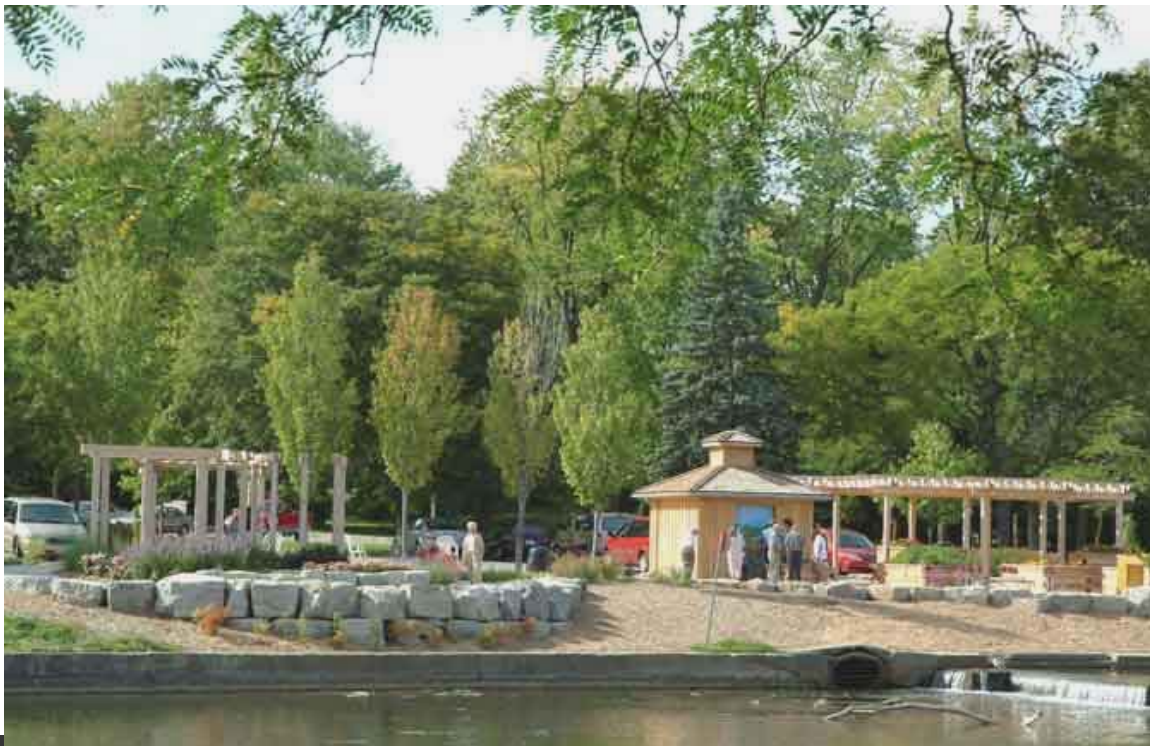
The Garden from across the river

If you’re interested in volunteering in Spring 2006, please contact Debbie Ebanks at 827-1926 or debbieebanks@sympatico.ca .