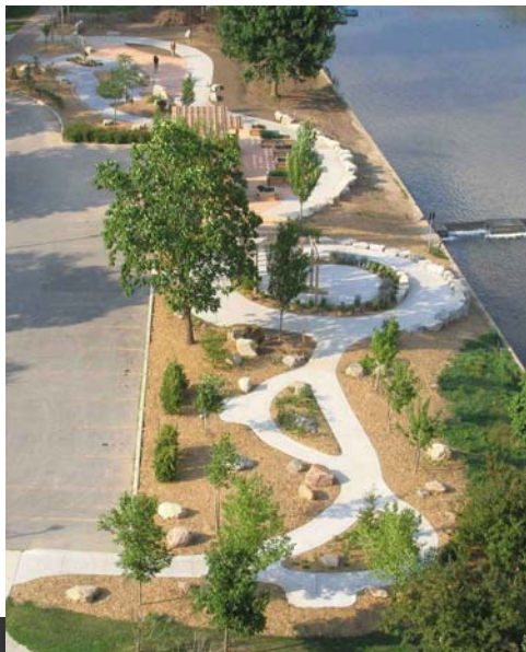
A bird's eye view

The Guelph Enabling Garden opened in July after five years of dreaming, planning and hard work from many committed people. It flourished through the summer under the care of a committed group of volunteers and ended the first season with the planting of over 1000 donated spring bulbs.